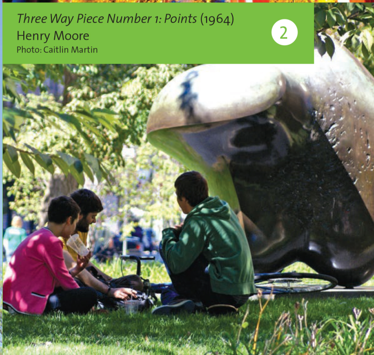
Three Way Piece Number 1: Points (1964) Henry Moore

Each audio program tells the distinct story, civic effort, and creative expression behind each sculpture in a conversational style. Go at your own pace, listen to one stop at a time, and create your own sequence. Unique audio programs are available for more than 60 outdoor sculptures throughout Center City Philadelphia and Fairmount Park.