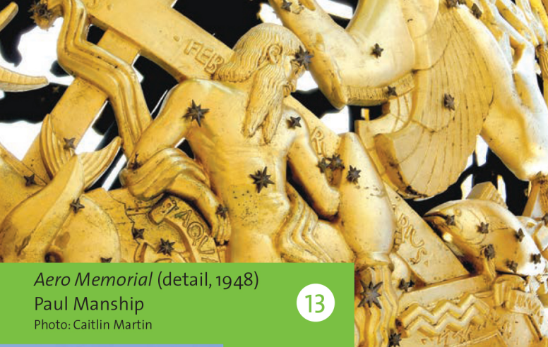
Aero Memorial (detail, 1948) Paul Manship