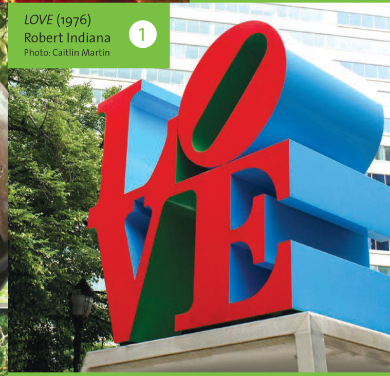
LOVE (1976) Robert Indiana