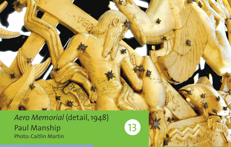
Aero Memorial (detail, 1948)