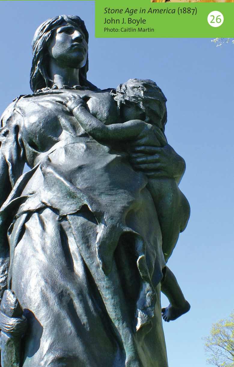
Stone Age in America (1887)