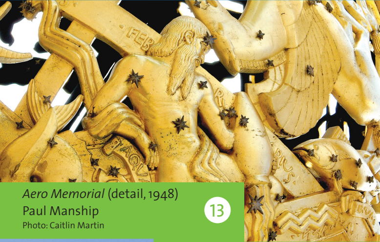
Aero Memorial (detail, 1948)