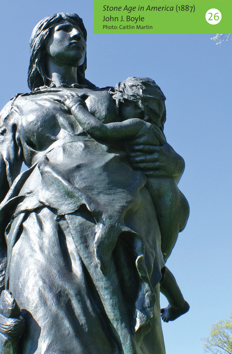
Stone Age in America (1887)